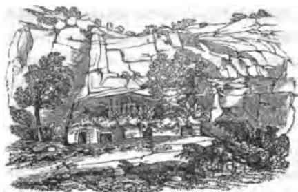
Quarries of Pentelicus.

of which, on the right, is a chapel with the painted figure of the Virgin to receive the Greeks' prayers. Within are vast humid caverns, over which the wide roof awfully extends, adorned with hollow tubes like icicles, while a small transparent petrifying stream trickles down the rock. On one side are small chambers communicating with subterraneous avenues, used, no doubt, as places of refuge during the revolution, or as the haunts of robbers. Bones of animals and stones blackened with smoke showed that but lately some part had been occupied as a habitation. The great excavations around, blocks of marble lying as they fell, perhaps, two thousand years ago, and the appearances of having been once a scene of immense industry and labour, stand in striking contrast with the desolation and solitude now existing. Probably the hammer and chisel will never be heard there more, great temples will no more be raised, and modern genius will never, like the Greeks of old, make the rude blocks of marble speak.